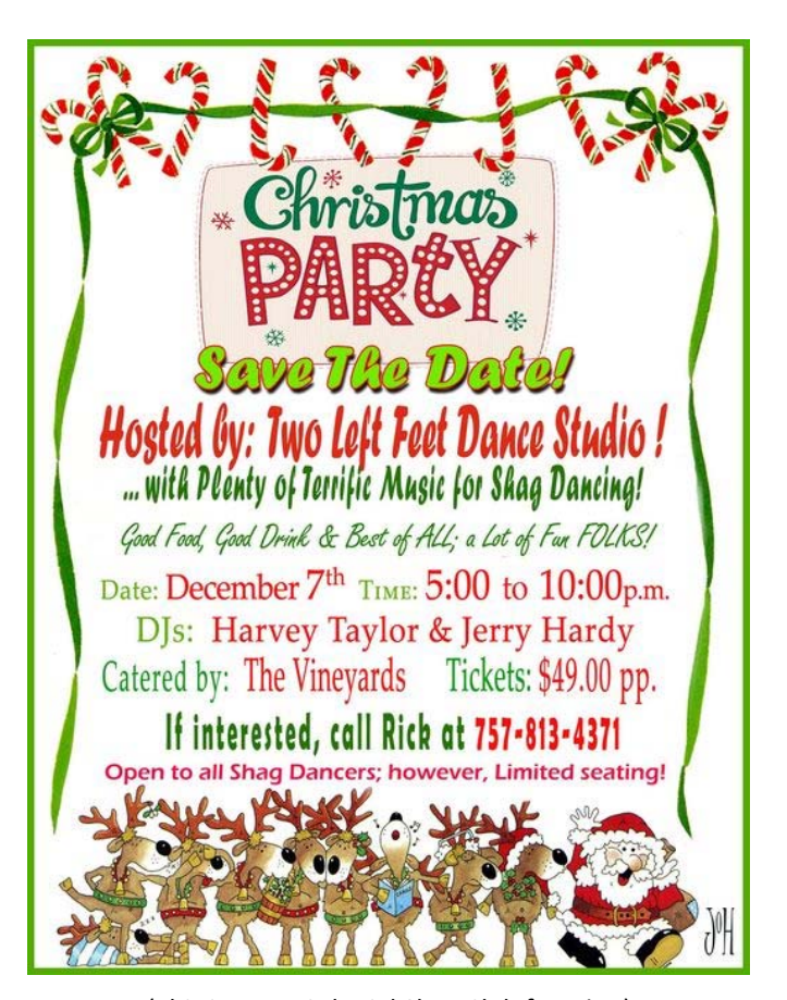
(This is not a Colonial Shag Club function)